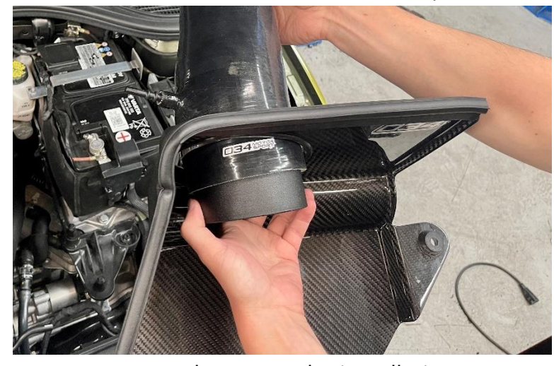
You are now ready to start the installation process.