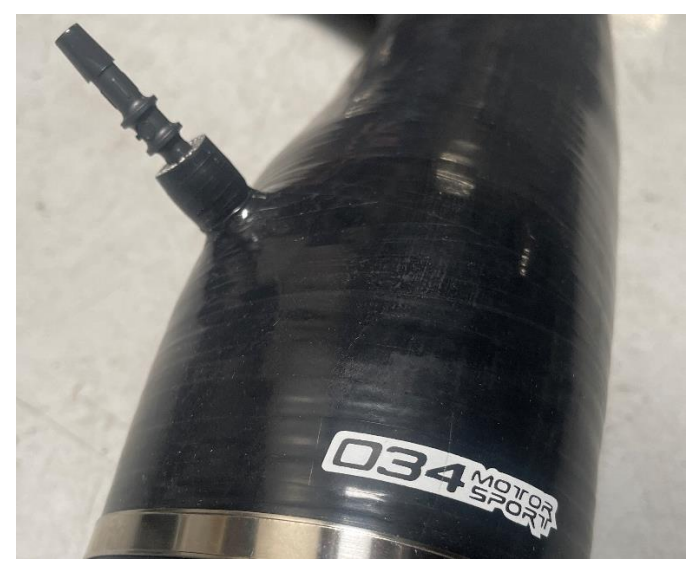
Step 6 Attach the intake hose to the adapter.

Insert the barbed fitting into the vacuum line provision on the intake hose.