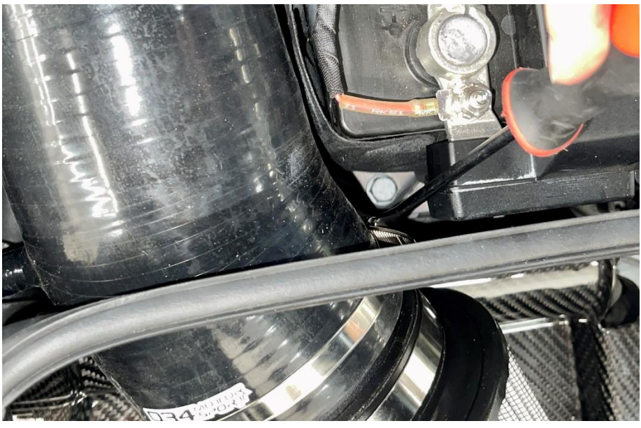
And lastly, the intake hose to turbo inlet.

As well as the intake hose to the adapter.