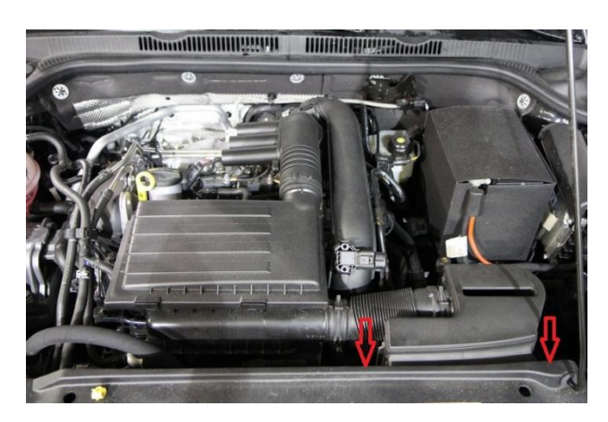
Step 2: Remove the clamp holding the intake to the turbo inlet.

Step 1: Remove the two T25 torx screws that hold the air intake to the radiator support.