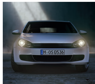
Golf VI with halogen headlights

Turn the redesign of your car's lighting system into a fun DIY project.