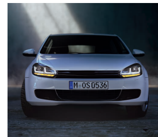
Golf VI with LEDiving® XENARC® headlights