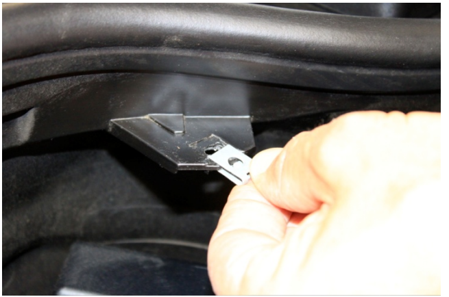
5. Remove and discard metal screw clip.

Remove bracket mounting screw with a T20 Torx. 4.