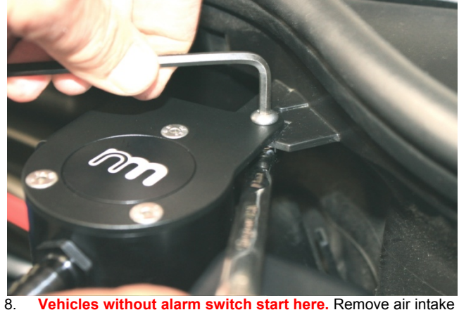
Vehicles without alarm switch start here. Remove air intake pipe or factory air box for easier access. Using M6x 16mm Button Head screw, washer and lock nut mount Catch Tank to top side of tab on plastic firewall