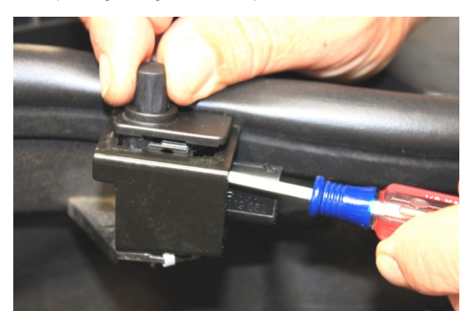
Between switch and mounting bracket there is locking tabs on each side, using a small screw driver push in to release.