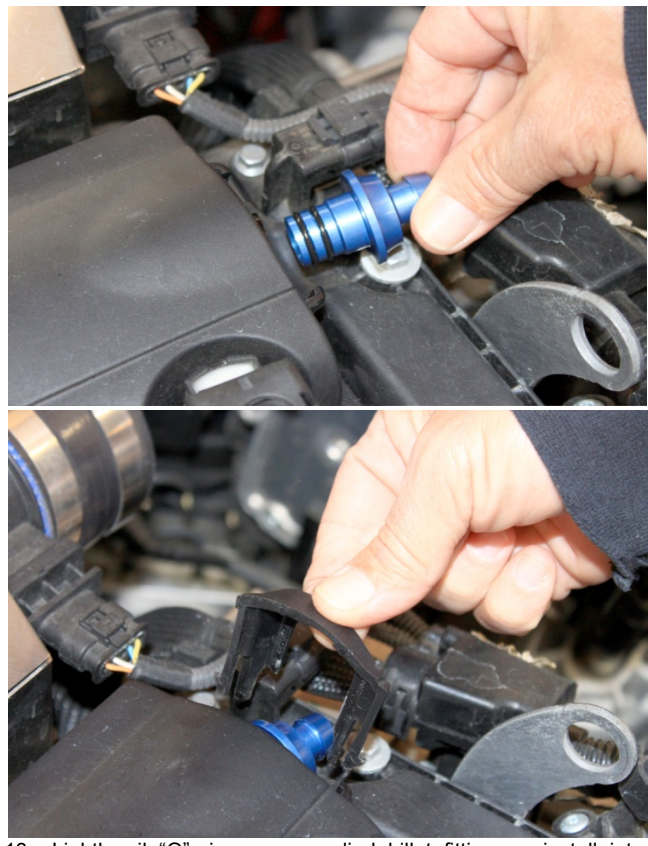
Lightly oil "O" rings on supplied billet fitting an install into breather port then reinstall factory retaining clip.