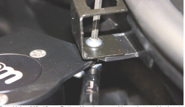
Using M6x16mm Button Head screw with washer and lock nut, 7. install in order; switch bracket, plastic mounting tab then Catch Tank bracket on bottom then washer and lock nut. Proceed to step #9.