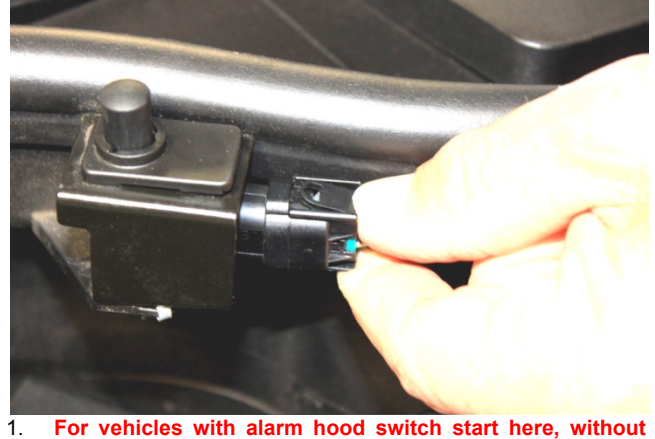
For vehicles with alarm hood switch start here, without switch proceed to step #8. Remove air intake tube or factory air box for easier access. Disconnect electrical connection by squeezing locking tab and then pull out.