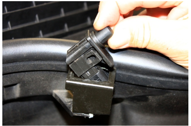
3. Remove switch.