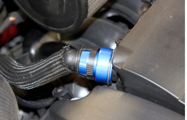
Disconnect breather hose at back left side of valve cover by squeezing locking collar. Lightly oil "O" ring on billet plug and install into valve cover port with locking spring clip facing outwards as pictured. Now re-install factory hose onto billet fitting.