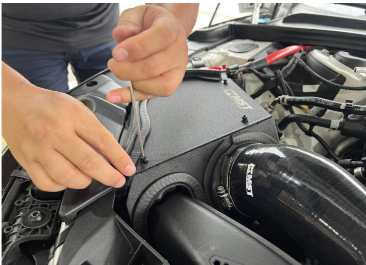
Figure 9: Install the heat shield cover and secure with bolt.