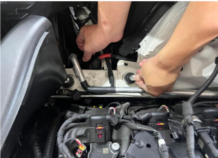
Figure 3: Install the ALU mount and rubber.