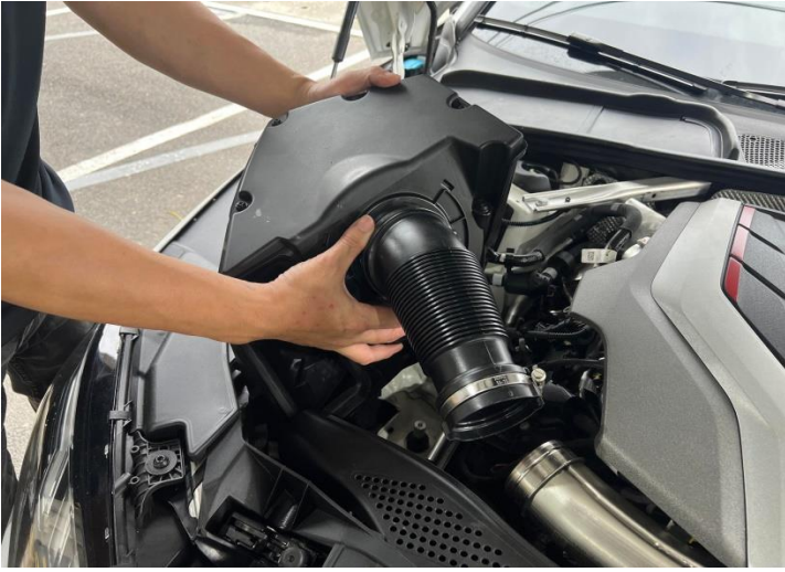
Figure 1: Loosen the hose clamp and remove the air box.