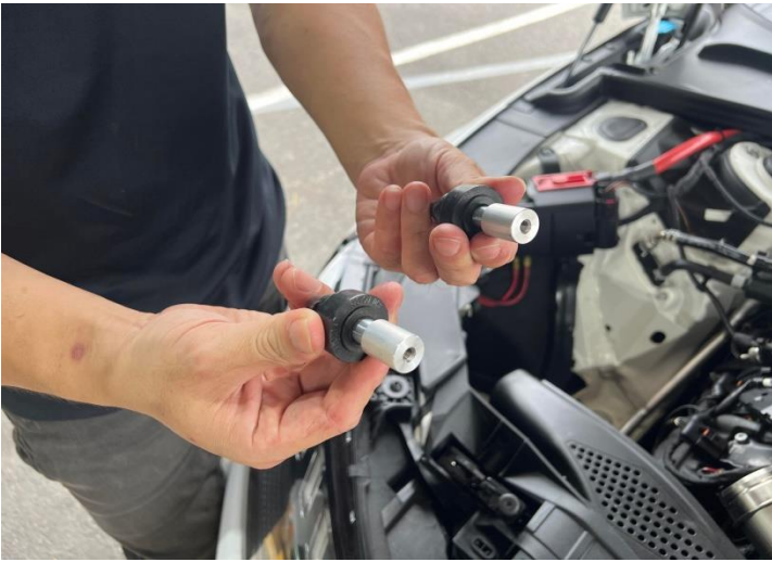
Figure 2: Remove the rubber from the stock air box and install the ALU mount on rubber.