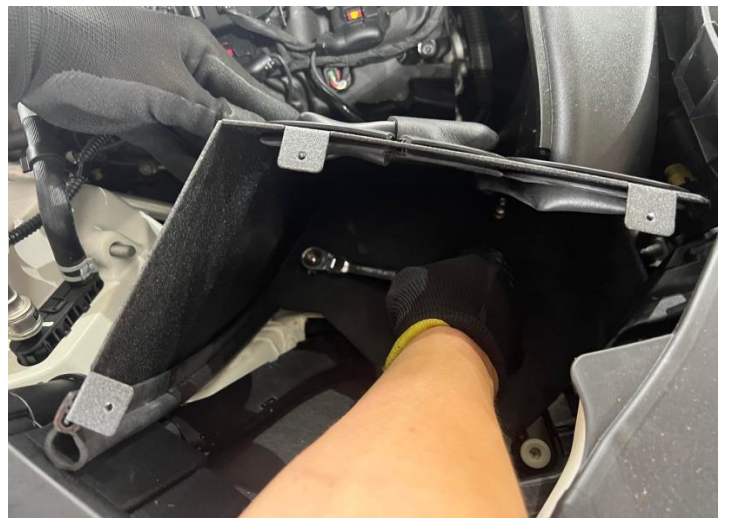
Figure 5: Secure with bolt.