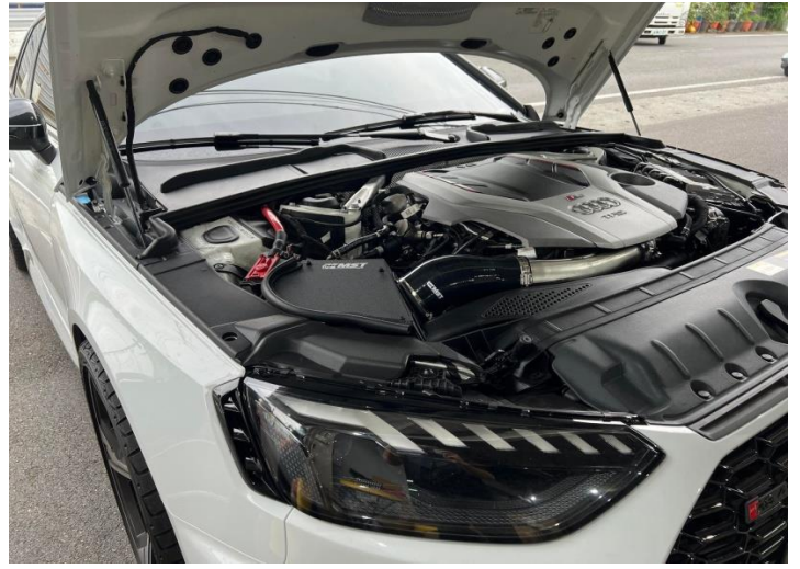
Figure 10: Congratulations! You have just completed the installation of this intake system. Periodically, check the alignment of the intake, normal wear and tear can cause nuts and bolts to come loose.