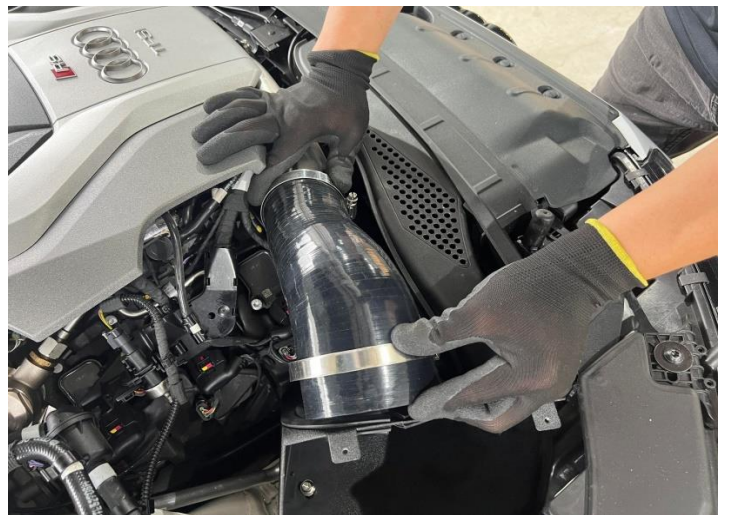
Figure 6: Install the MST silicone hose.