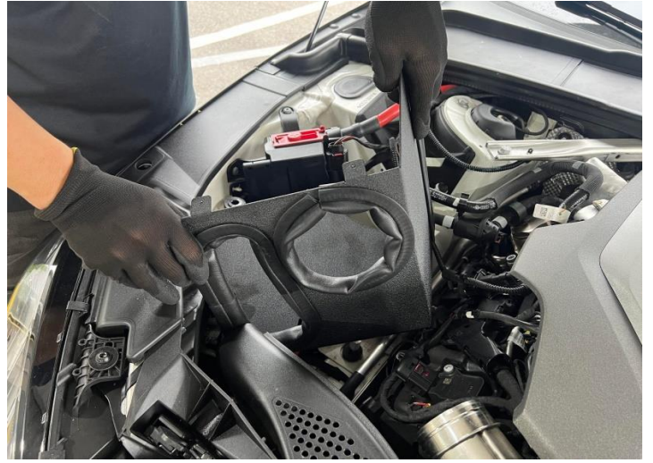
Figure 4: Install the heat shield.