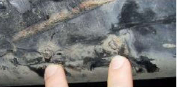
fig. 1 fig. 2

• The bushing, bushing bracket and bushing band clamp must be installed on the sway bar and mounted to the axle as shown in figures 3 & 4. Note that the center-to-center measurement between bushings must be 22.8 inches (580mm).